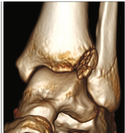
Fig. 3. 3D CT scan.