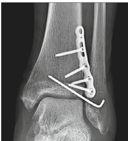
Fig. 4. Comminuted Tillaux fracture fixation with plate osteosynthesis and additional K wire.