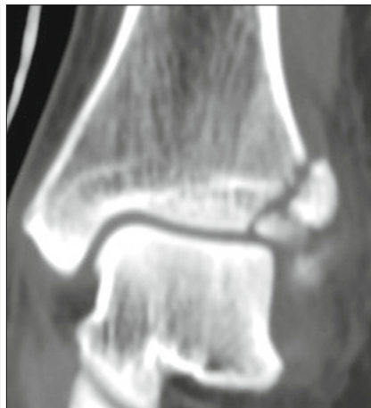
Fig. 2. The same fracture as in Fig. 1 on CT scan.