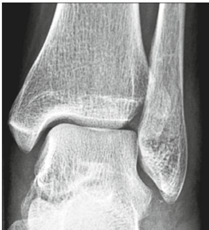
Fig. 1. "Invisible" Tillaux fracture.