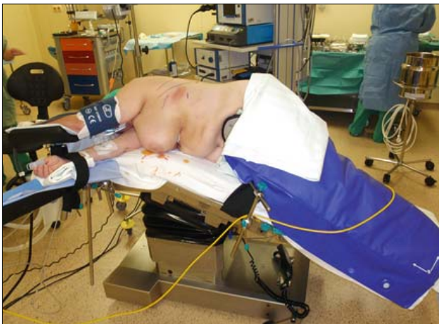
Fig. 1. VATS lobectomy – patient position.