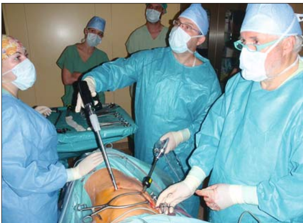
Fig. 2. Left upper VATS lobectomy – operation team position.