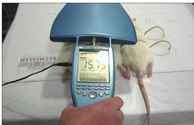
Fig. 1. Frequency meter device.

Plasma 5-HT and glutamate levels were measured by enzyme immunoassay (EIA) using commercial kits (Cusabio Biotech Co.,